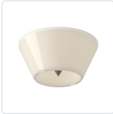
FM45710-BG/GO Brushed Gold/Glossy Opal Glass